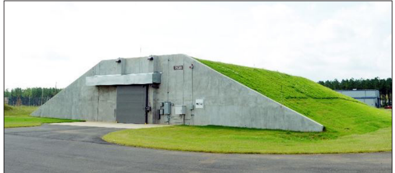
Explosives Safety Quantity Distance (ESQD) analysis for Earth-Covered Magazines is one of the many related specialized skillsets within the MCX.